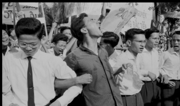
Anti-Communist Students demonstrating in Saigon on the 10th anniversary of the 1954 Geneva accords, South Vietnam, July 1964.